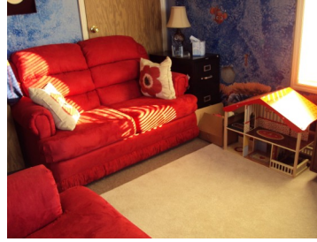
LCCAC Mental Health Therapy Room.