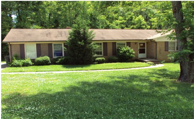
Future CAC building located on Policarp Street.

Lincoln County on Policarp Street in Lincolnton. As of