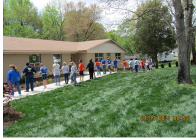
Lake Norman Christian Academy Students circle the new child advocacy center linking hands as they ended the day with a prayer to the home and the victims that will soon be served there.